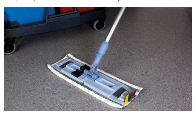
Figure 1 Microfibre mop pad with dual bucket system