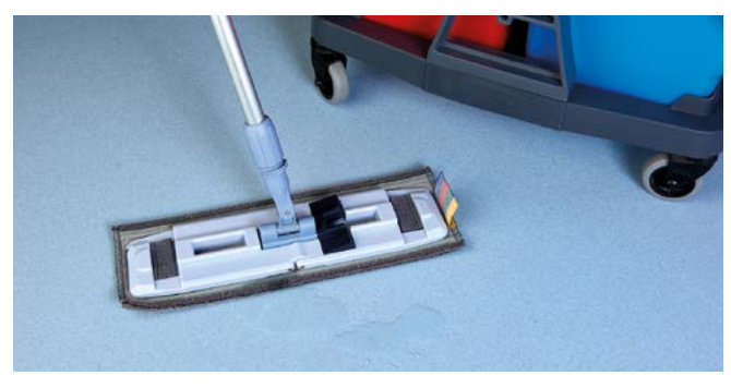
Figure 2 Safety mop pad with dual bucket system